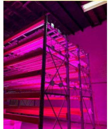
River City Growers in Allegheny County

Example of a rebate-funded LED lighting upgrade for indoor agriculture.